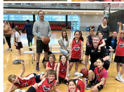
Wind-up fun with the U8's.