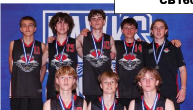
CB166 U16 Div 5