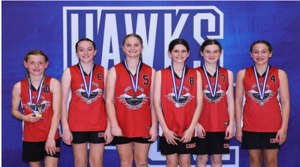
CB131 U14 Div 2