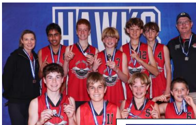
CB160 U14 Div 3

You do not need to add your child to the waitlist, they will automatically be invited.