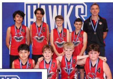
CB144 U14 Div 6