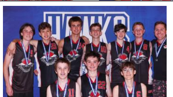
CB160 U14 Div 3