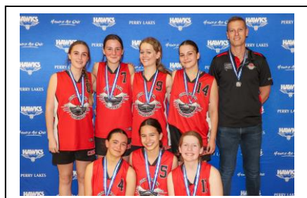
CB149 U18 Div 2