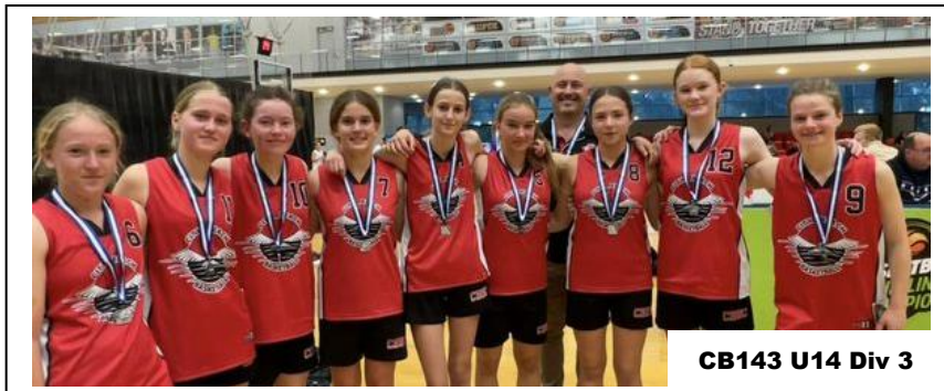
CB143 U14 Div 3