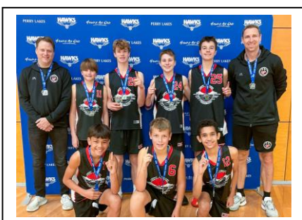
CB156 U14 Div 1

Thank you to all our players and parents/caregivers for your engagement and participation in the 2023 winter basketball season. Thanks for choosing City Beach Basketball Club and making it such a fantastic club to be a part of.