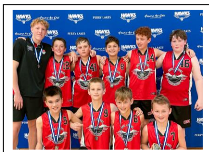
CB142 U14 Div 6